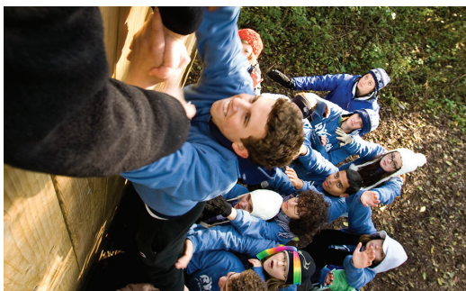
RYLA events instill values of service and leadership at an early age.

Interact and Rotaract clubs are sponsored by nearby Rotary clubs. Ask your club leaders how you can get involved if you'd like to work with local Interact and Rotaract clubs.