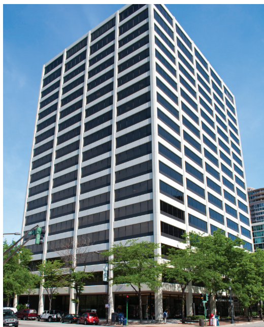
One Rotary Center in Evanston, Illinois, USA

Rotary International is administered by the Secretariat, which comprises the general secretary and nearly 800 employees who work to support clubs and districts around the world. Rotary's world headquarters is in Evanston, Illinois, USA, in a building called One Rotary Center. It includes a 190-seat auditorium, Rotary's archives, and an executive suite with conference rooms for the RI Board of Directors and Rotary Foundation Trustees and the offices of the