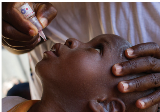
Rotarian administering polio vaccine in Nigeria, Africa

Our members’ and others’ contributions to the Foundation allow us to bring sustainable change to communities in need. Ask your club’s Rotary Foundation committee chair or visit rotary.org/donate to learn how you can support our Foundation. To learn more, download The Rotary Foundation Reference Guide or take the Rotary Foundation Basics course in Rotary’s Learning Center .