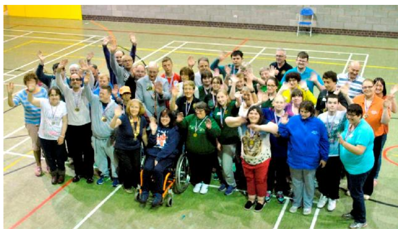
What a great day we had at the Wrekin Sports Day for the Disabled

A really rewarding day at the Wrekin Sports Day for the Disabled on 9 th July, I helped out in the morning and early afternoon, before changing into my more formal jacket and tie to present medals alongside the Mayor of Telford & Wrekin.