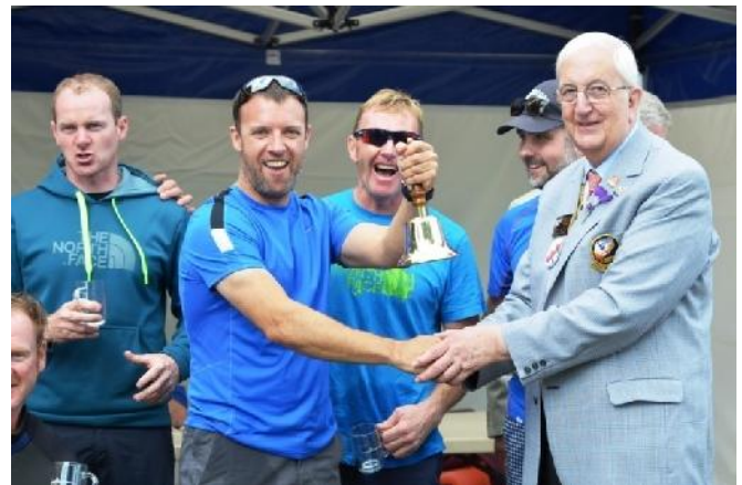
Ellesmere Regatta – the winning men's team

On Tuesday 5 th July I was at the Charter event of the Wrexham Glyndwr Club – in District 1180, the Club was formed and chartered in just 5 months – if they can do it, so can we!