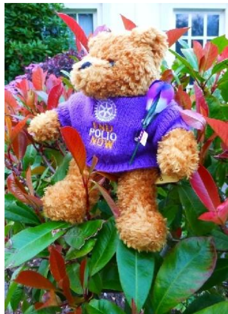
An undignified position outside the Park House Hotel at Shifnal, after the Ironbridge meeting