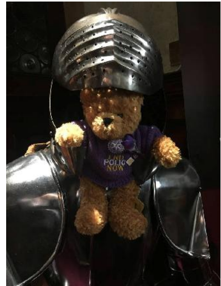
Trying on a suit of armour at the Tettenhall Club