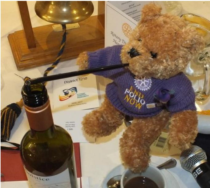
Enjoying a quick drink at the District Handover Dinner

A few photographs showing how the Polio Bear has got himself into some interesting situations during my travels: