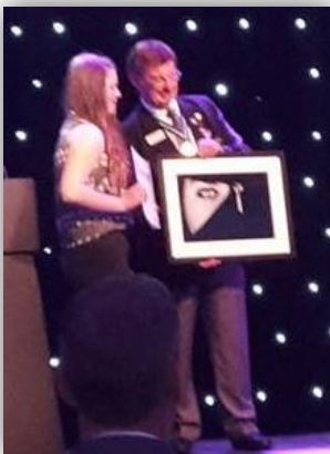
Young Photographer winner from Barr Beacon School sponsored by Aldridge Rotary

Photography is a talent and an ever popular art form. Entrants submit three photographs on a theme in black and white or colour, along with a description of the inspiration for their photographs. Rotary