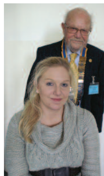
Youngest (sitting) and oldest Rotary presidents in District 1210