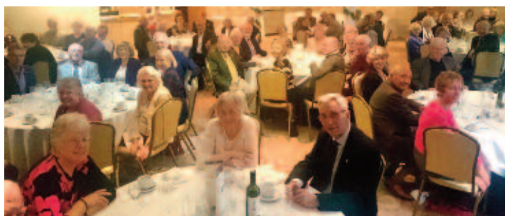
Selection of the diners

The five Rotary clubs in Telford joined together to mark "Rotary Day". Over 100 members and guests enjoyed a relaxed Sunday Lunch exchanging Rotary anecdotes and future projects until late into the afternoon.