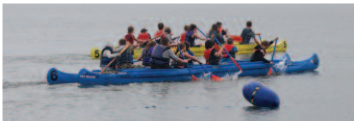
Youth Teams turning the Bouys

Anyone wishing to find out more about the activities of the Rotary Club of Ellesmere, or who might like to join, should contact the Secretary on 01691 777178.