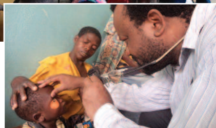
Eye surgery at Medic Malawi