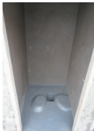
Cubicles with rendered brick walls not corrugated metal sheets.