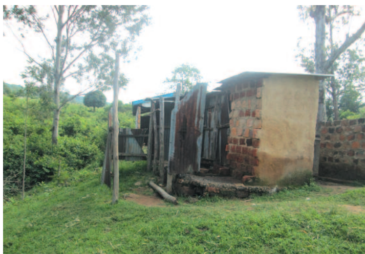
Sad and decaying the old toilet block sinking into its cess pit.