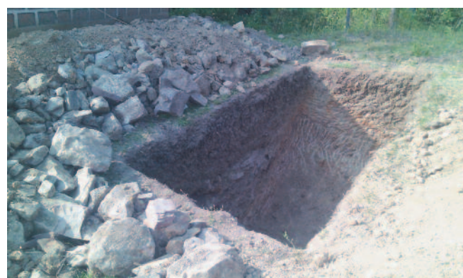
A big hole the cess pit dug out of rocky ground, not gravel.