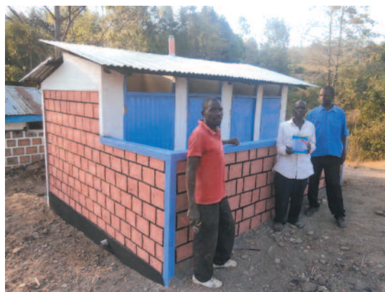
The finished school toilet block that persuaded the Kenya Ministry of Education to rescind its Closure Order on the school.