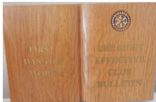
The text is FIRST WAS THE WORD and THE MOST EFFECTIVE CLUB BULLETIN