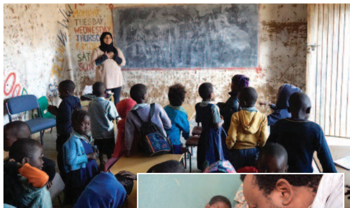
Medic malawi school