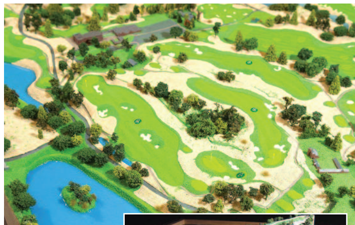
Plan of Woodseat Hall Golf Course

Currently the ground has been shaped and this year further development will take place in soil preparation, including the hauling of around 70,000 tons of sand to cap the fairways, after which some 50kms of irrigation piping and drainage has then to be installed before the final stages of seeding can take place. Plans are such that the course should be ready for use in 2017. Although this is being constructed for corporate use, golfing members of the Club are living in hope that they may be invited to play the course one day.