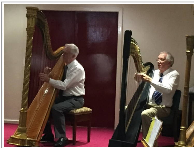
It's all fingers and thumbs to me!