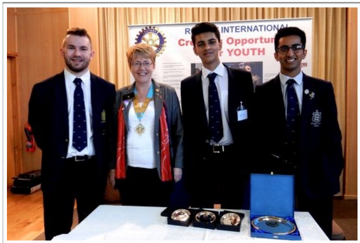
Adams Grammar School - Youth Speaks

On the 9th March we were entertained by the teams in the District Final Intermediate Youth Speaks Competition and the following evening by the Seniors. The standard was truly remarkable and the Intermediate was won by St. Edwards C of E Academy sponsored by RC of Leek and the Seniors was won by Adams Grammar School sponsored by the RC of Wellington. These two teams then proceeded to the Regional Final that was held on the 21st March, but sadly St. Edwards did not win this time around but they did themselves and the district proud.