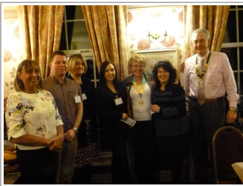
Brewood & District Satellite Club

This month I also attended a District Membership, Development and Retention Service Meeting and a District Youth Service Committee Meeting, all of which I thoroughly enjoyed.