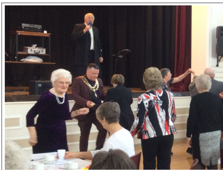
Rotary Club of Kidsgrove feeling the 60's groove!

Well done to all the members of the Rotary Club of Kidsgrove. A great example of what "doing good in the