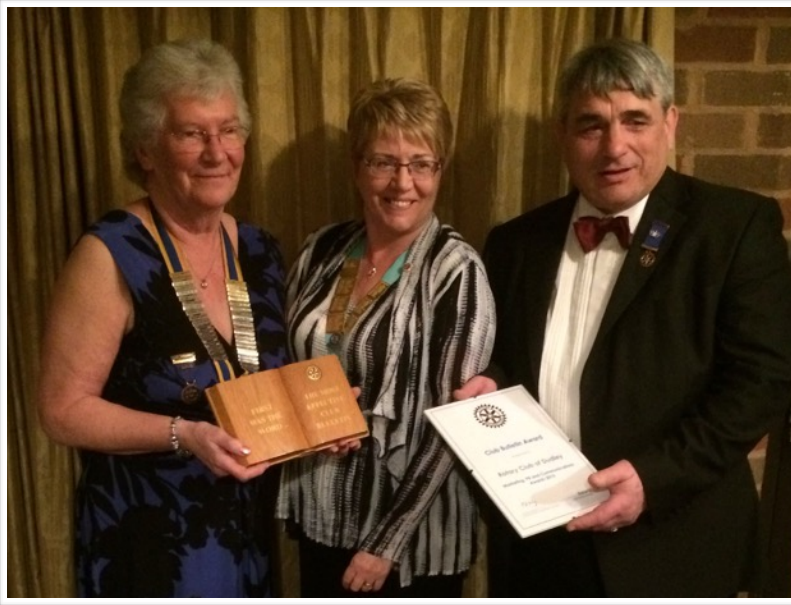
RC of Dudley receiving the RIBI Best Club Bulletin Award