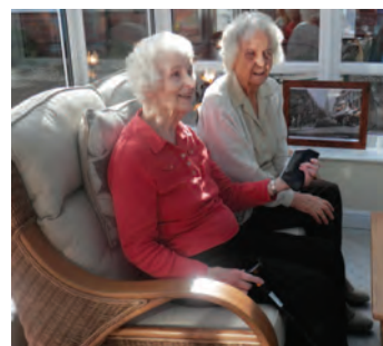
Then residents trying out the chairs for comfort...