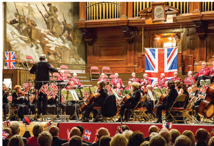
Performers on stage

Proceeds from the event will go towards the three nominated charities of Walsall Rotary Club: Teenage Cancer Trust, Heart Care Walsall, and Midlands Air Ambulance.