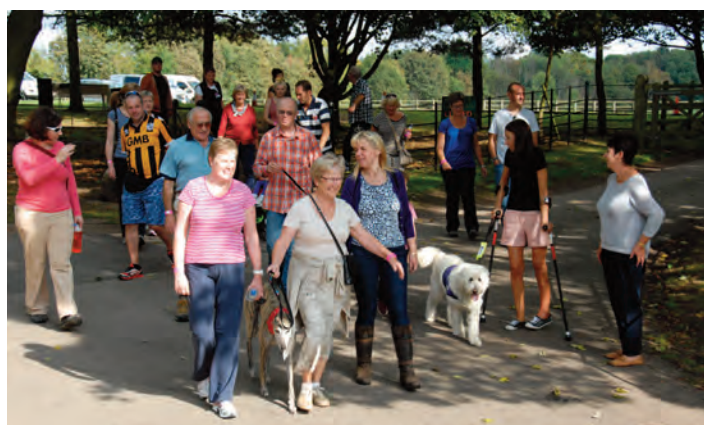
Walkers enjoying their day in Weston Park