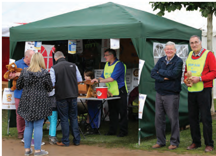
Teddy Bear Tombola Stand

Ellesmere and Hinterlands events. These have included the Ellesmere Carnival, Crifftons (Dudleston Heath) 'Fun Day', Ellesmere Festival and the MereFest. Variations of the stall will keep popping up at future events, so that we can continue to support local, national and international causes. Dates for the calendar include: Crifftons Christmas Festival at the Parish Hall in the mid November and the Ellesmere Winter Festival on the 28th November. The Club will make a donation to the Ellesmere War Memorial Restoration Fund from some of the proceeds.