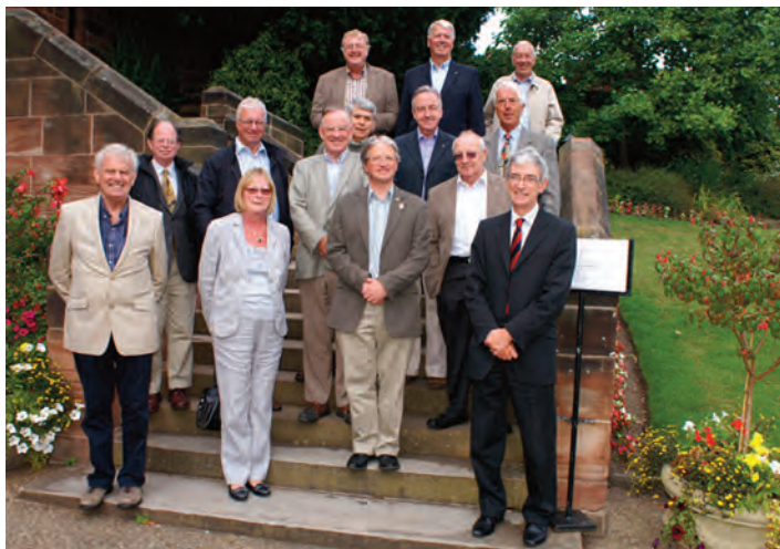
Members enjoying a night at the Castle.

Roger de Montgomery has featured twice in a fortnight in talks to members of Shawbury and Mid Shropshire Rotary. When a group of Rotarians visited Shrewsbury Castle and Regimental Museum last Tuesday the name Roger de Montgomery was prominent. For Roger de Montgomery built fortifications on the Welsh border to keep the warring Welsh at bay. But he didn't see Shrewsbury Castle completed. He became a monk at the nearby Abbey and three days later he died.