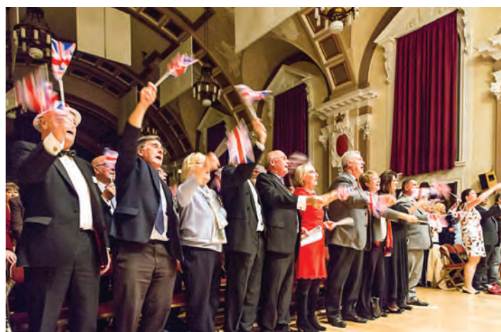
Audience joining in the singing