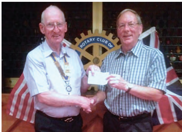
Wolstanton Rotary raising £1000 for Macmillan Cancer Support.

He also thanked all the teams for their support, club members for their hard work arranging the day and wives and partners of Rotarians who organised a raffle.