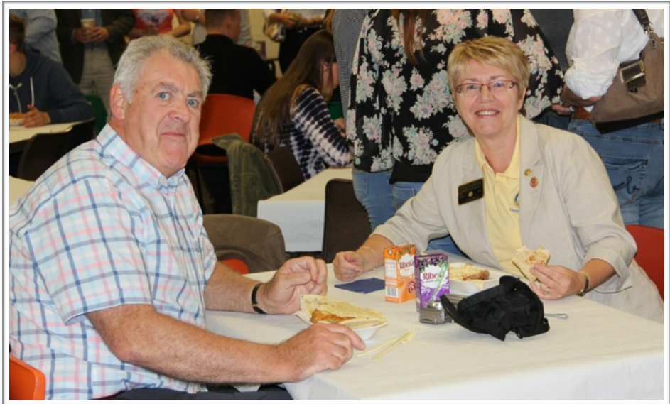
Enjoying the food at RYLA

The last week in August is always special as it is the RYLA Camp, which is held at Kibblestone Scout Camp. I spent an afternoon being shown round the campsite and seeing the facilities. We are so lucky to have these facilities in our own district.