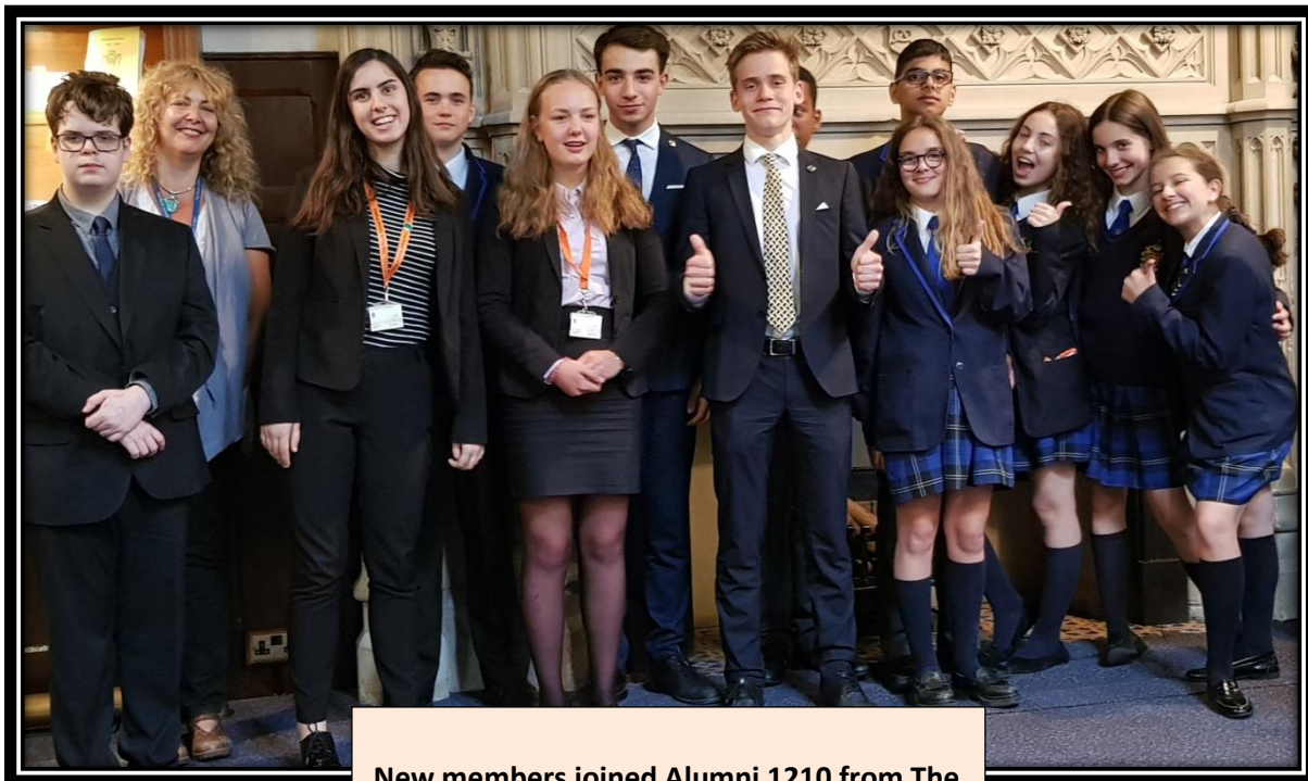
New members joined Alumni 1210 from The Royal School Wolverhampton Interact Club

The club is doing amazing work both locally and internationally, whilst having a great deal of fun and eating lots of doughnuts!